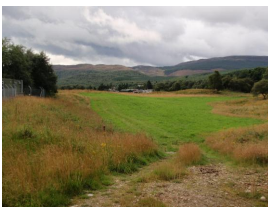
Fig. 3-Site for car park and track