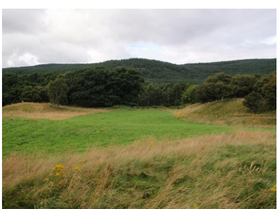
Fig.5- General view of track site