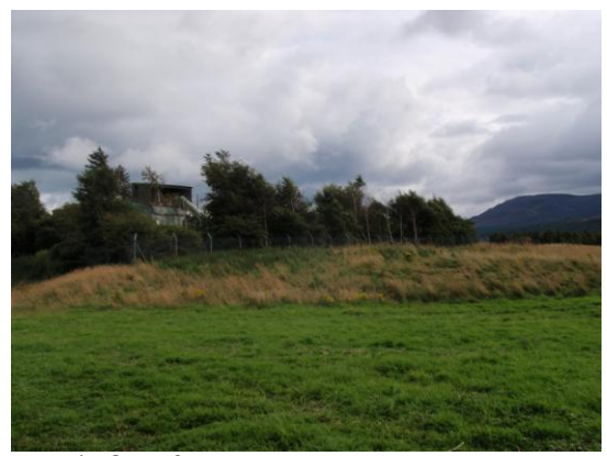
Fig. 4- Site for visitor building